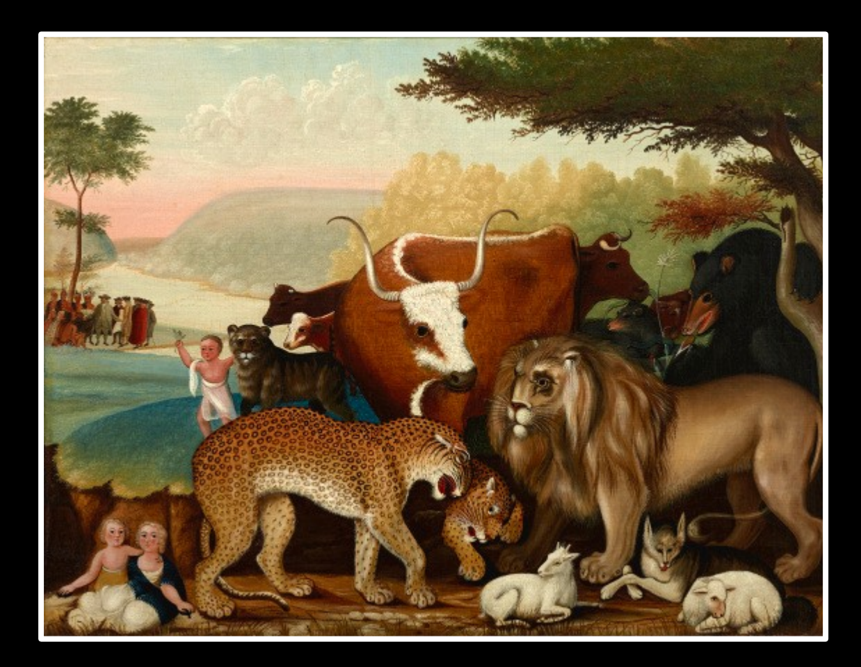
The Peaceable Kingdom. Edward Hicks, 1846-47.