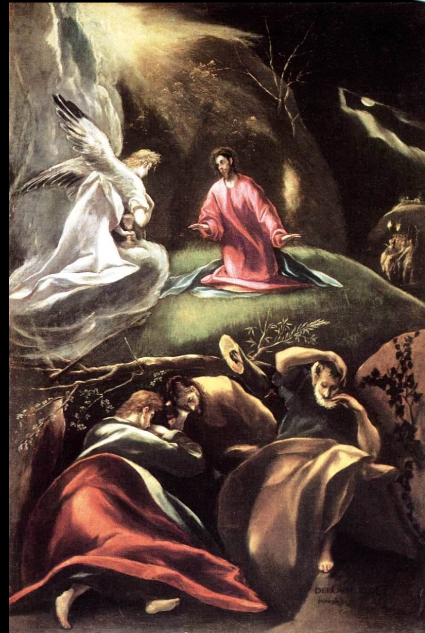
Agony in the Garden, El Greco, 1590s

42 Rise up, let us go; lo, he that betrayeth me is at hand. Mark 14: 36-42 (KJV)