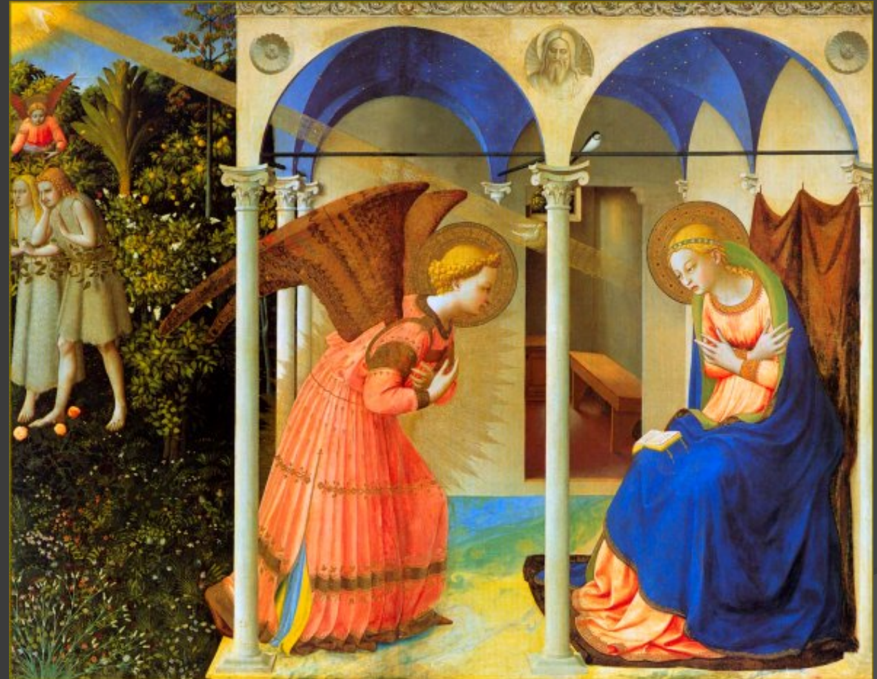
Annunciation. Fra Angelico, c. 1450.

38 Then Mary said, “ Behold the maidservant of the Lord! Let it be to me according to your word. ” And the angel departed from her.