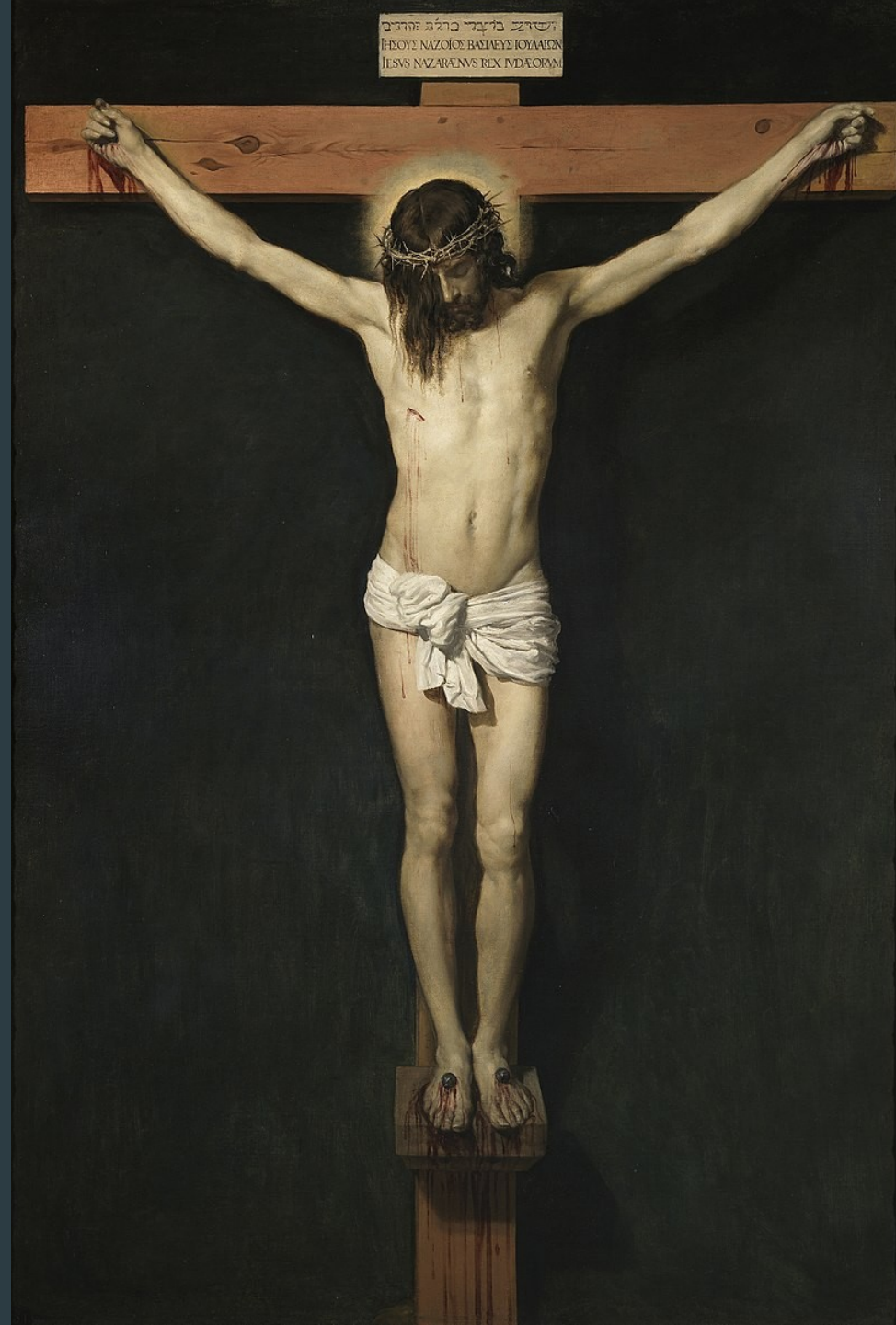
Cristo crucificado. Diego Velázquez, 1632.