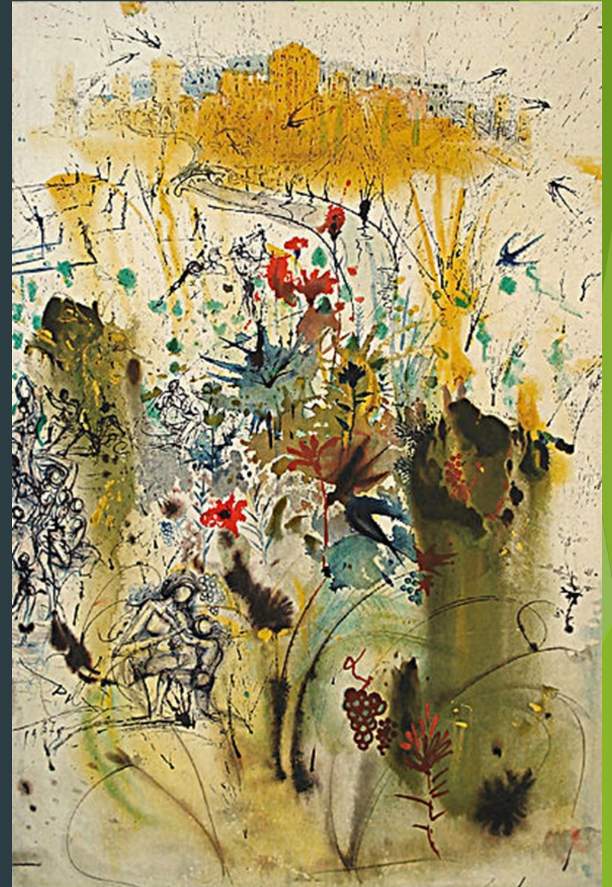
Aliyan, The Rebirth of Israel . Salvador Dalí, ca.1968.

"The mountains and the hills shall break forth before you into singing and all the trees of the field shall clap their hands" (Isaiah 55:12)