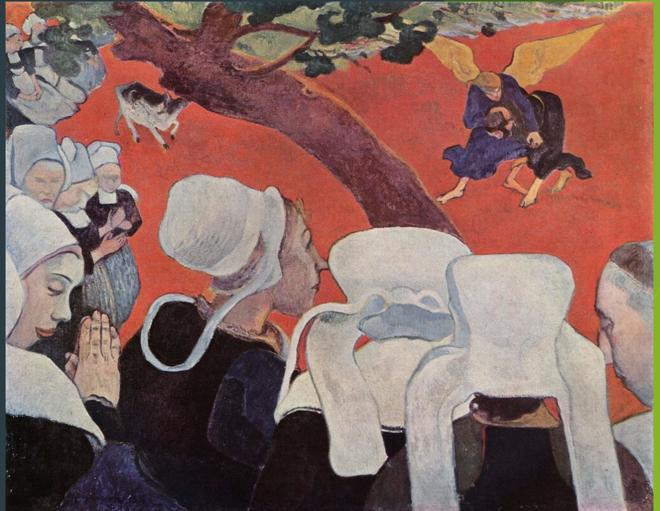
Vision after the Sermon. Paul Gauguin, 1888.