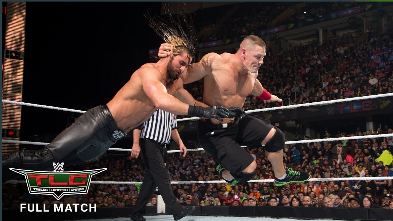
WWE Full Match: John Cena vs Seth Rollins