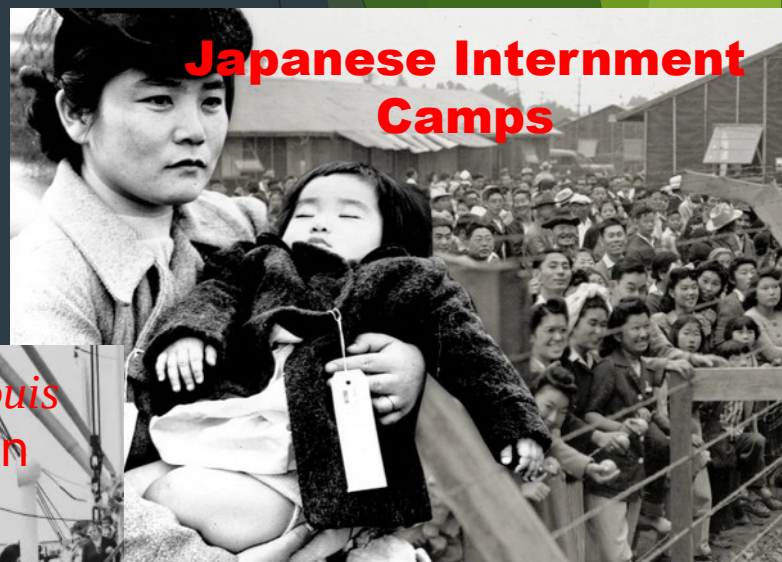
Japanese Internment Camps

In the name of... More land. More money. More power. More status.