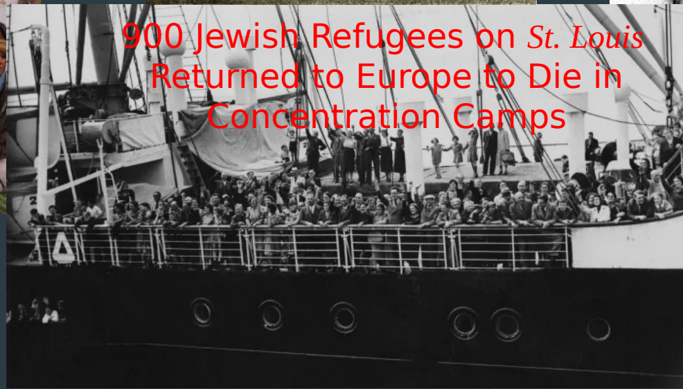
900 Jewish Refugees on St. Louis Returned to Europe to Die in Concentration Camps