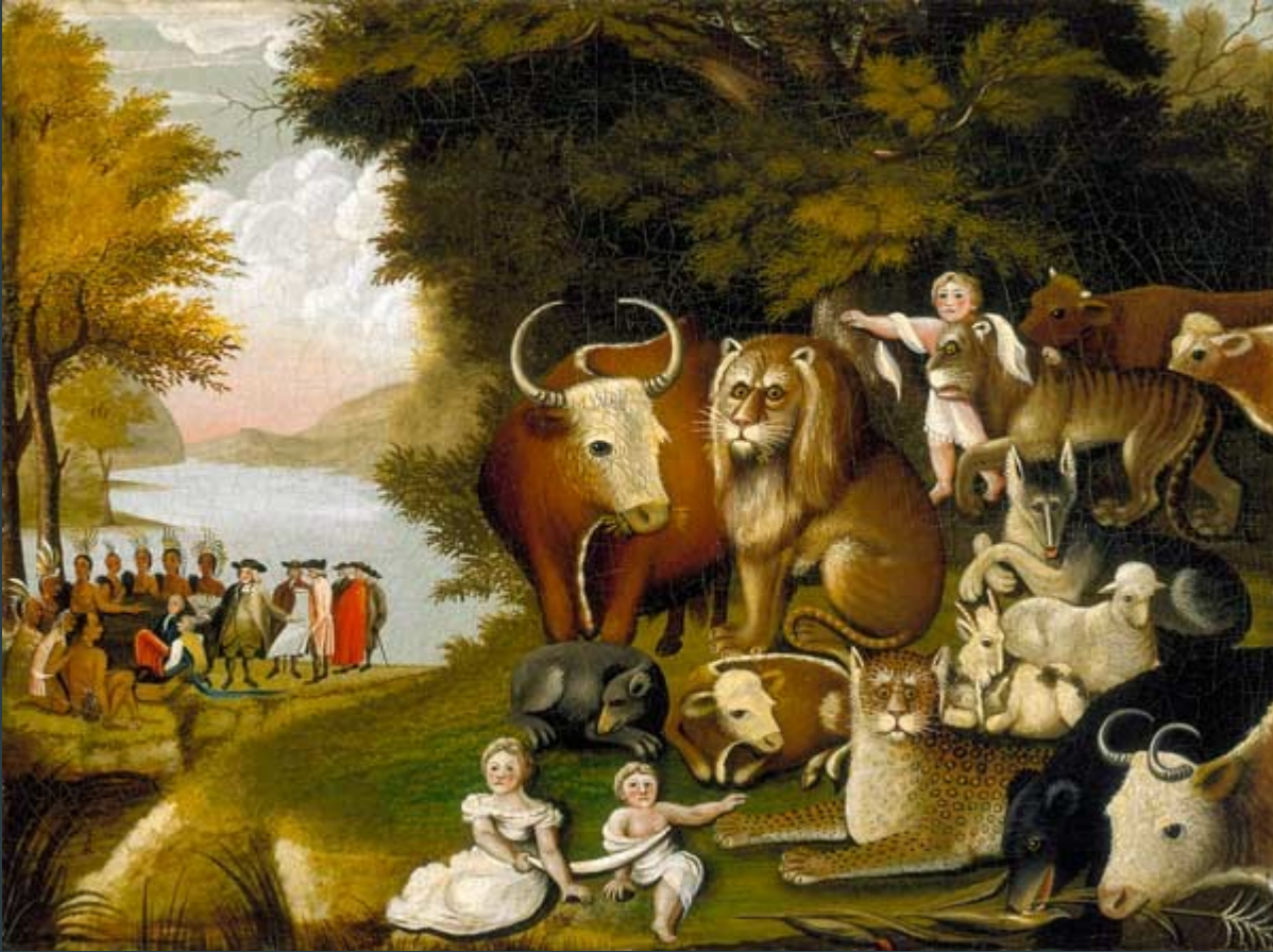
Peaceable Kingdom. Edward Hicks, ca 1833.