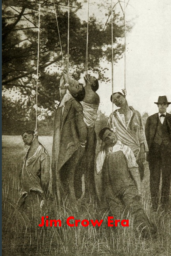
Jim Crow Era

In the name of... More land. More money. More power. More status.