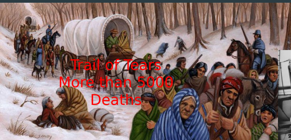
Trail of Tears More than 5000 Deaths