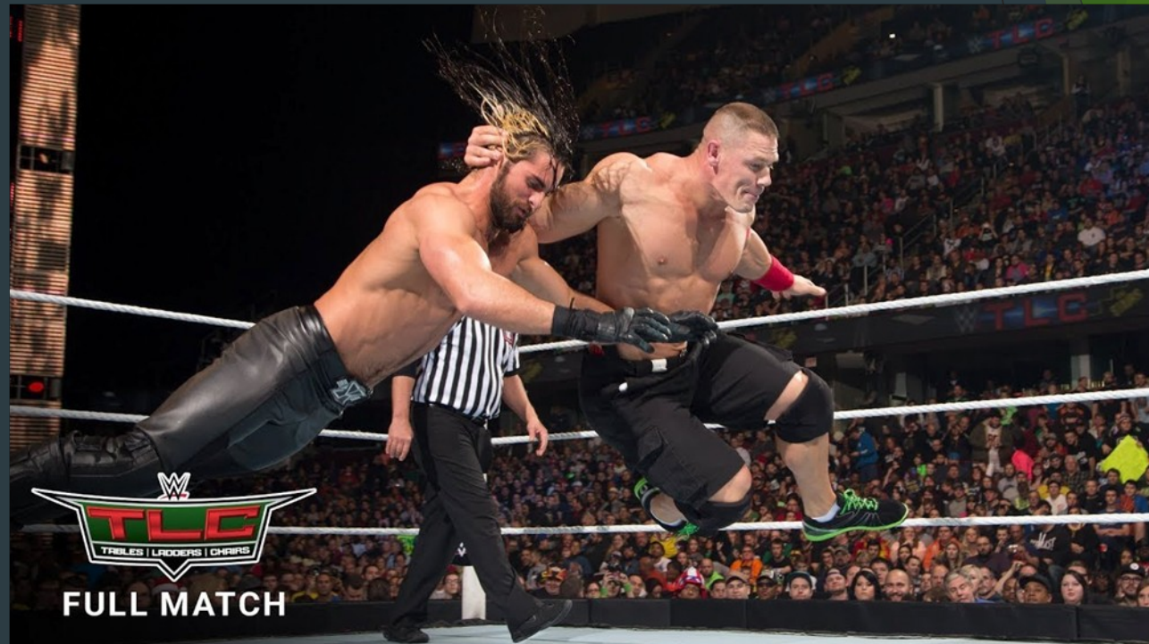
WWE Full Match: John Cena vs Seth Rollins