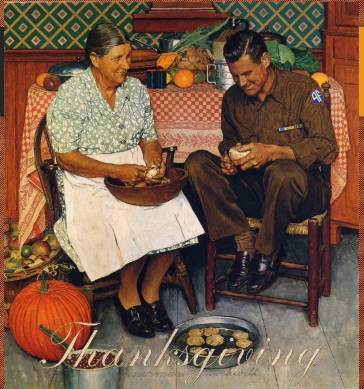
Thanksgiving: Mother and Son Peeling Potatoes, 1945

Thanksgiving: Mother and Son Peeling Potatoes. Norman Rockwell, 1945.