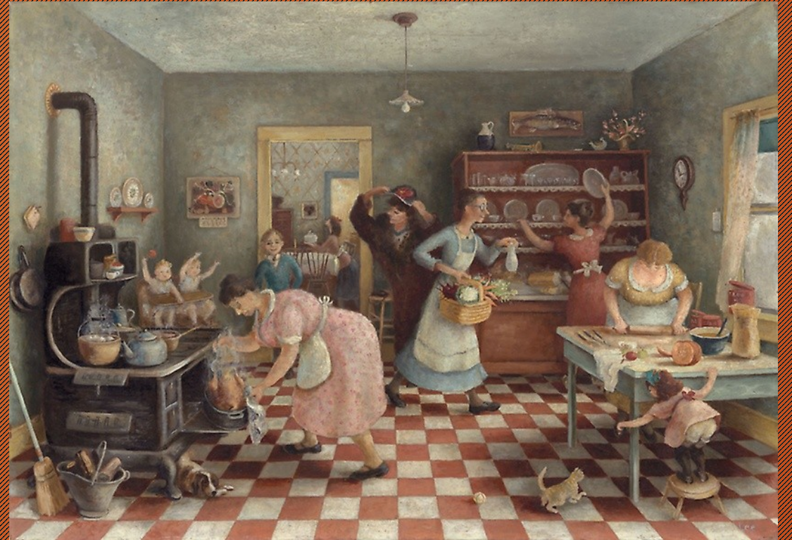
Thanksgiving. Doris Lee, 1935.