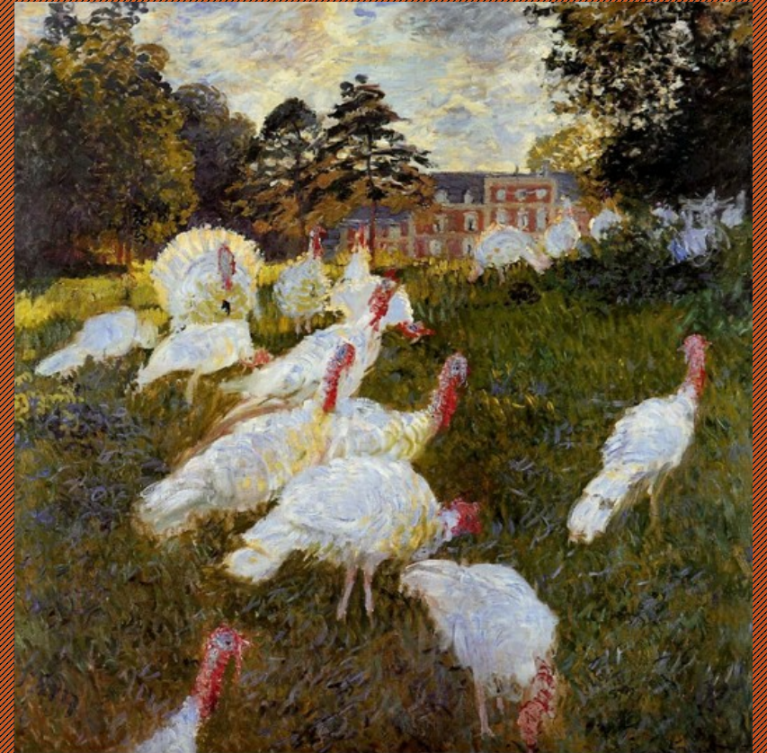
The Turkeys. Claude Monet, 1876.