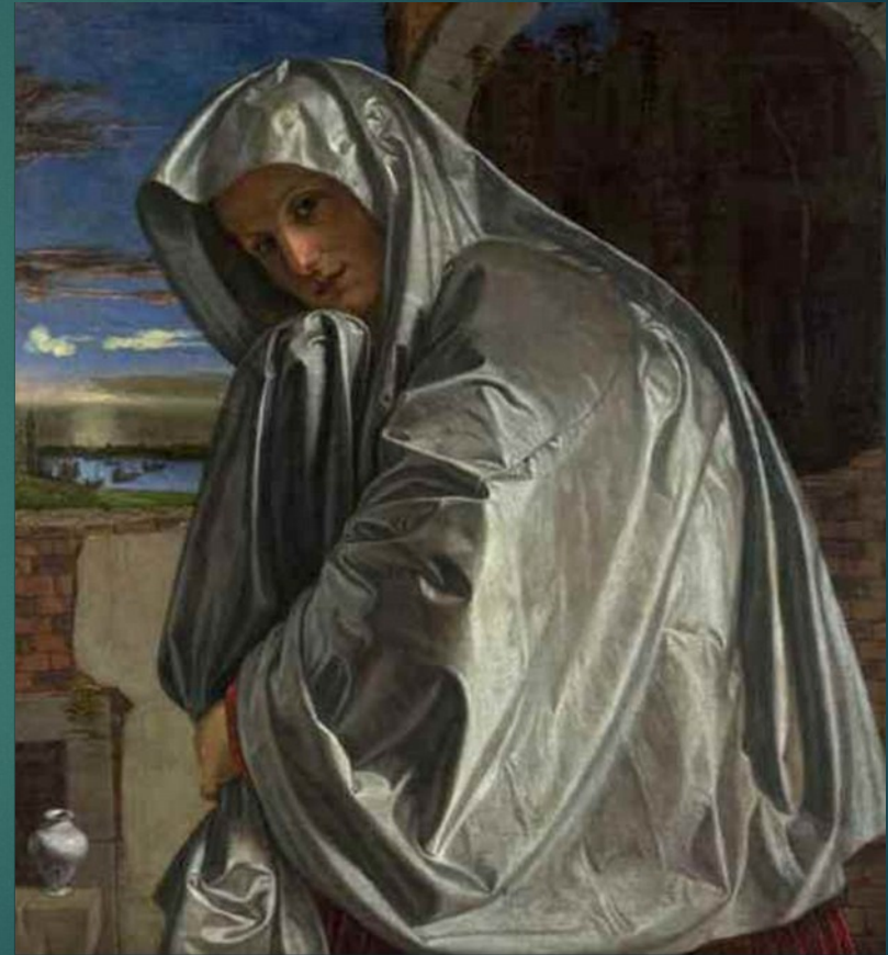
Mary Magdalene Approaching the Tomb. Gian Girolamo Savoldo, 1535-40.