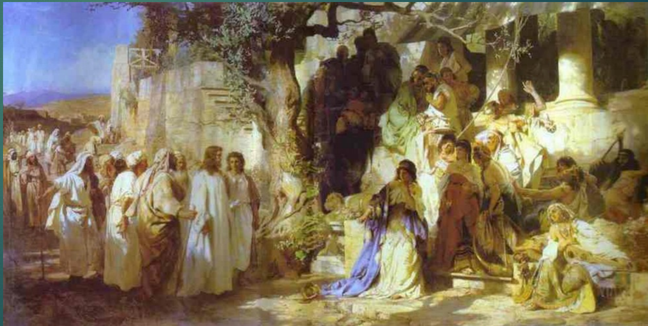
The First Meeting of Christ and Mary Magdala. Henryk Hector Siemiradzki, 1873.