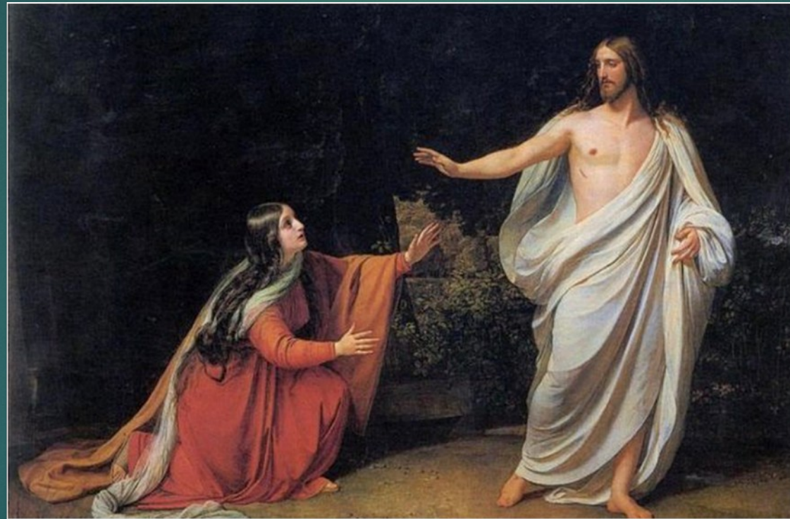
Christ's Appearance to Mary Magdalene after the Resurrection. Alexander Ivanov, 1835.

Why could she recognize the Christ and the disciples couldn't?