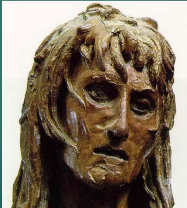
Penitent Magdalene , detail of head only, Donatello, 1455.

Do you or did you ever feel unworthy of God's call?