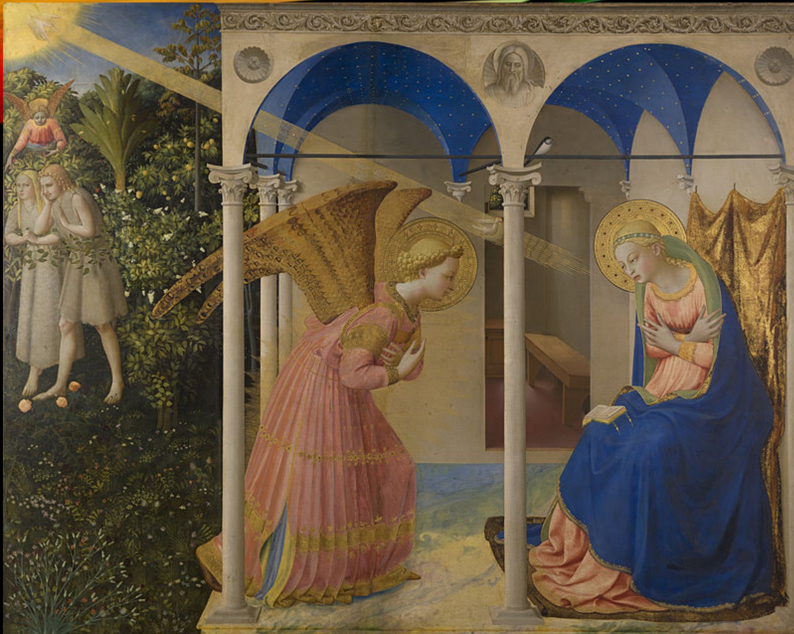
Annunciation. Fra Angelico, 1435 ca.