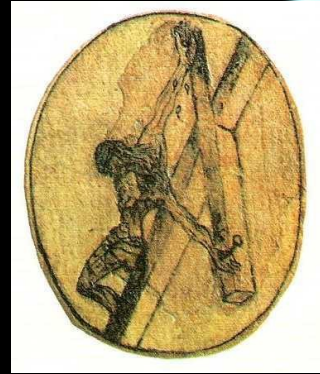
Crucifixion sketch by St. John of the Cross, c. 1550.