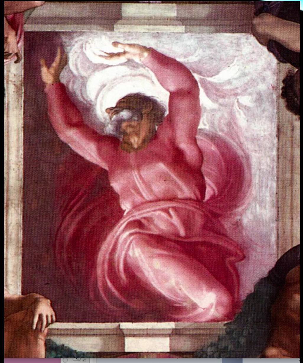
The Separation of Light and Darkness. Michelangelo, 1475 – 1564, fresco.